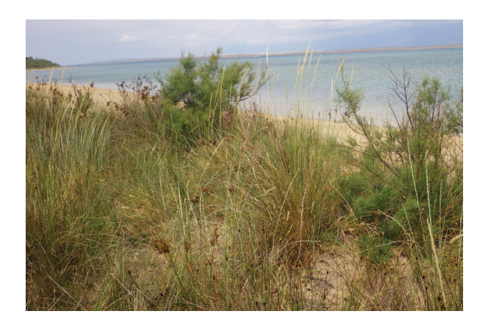
Fig. 3. Habitat of Ammophila arenaria (L.) Link subsp. arundinacea H. Lindb. in Kraljičina plaža near the town of Nin.

Croatia are very rare and psammophytic vegetation of the order Ammophiletalia is extremely endangered (Alegro et al. 2004). Due to the very small and localized areas of these habitats, as well as by the quoted psammophytic species they are also colonized by many species of neighbouring ruderalized habitats as can be seen from those three phytosociological relevés (Tab. 1). Therefore, the researched community can be considered an impoverished wet variant of the association Euphorbio paraliae-Agropyretum junceiformis Tüxen in Br.-Bl. et Tüxen 1952 corr. Darimont, Duvigneaud et Lambinon 1962 ( Ammophilion Br.-Bl. 1921, Ammophiletalia Br.-Bl. et Tüxen ex Westhoff et al. 1946) as defined by Šilc et al. (2016).