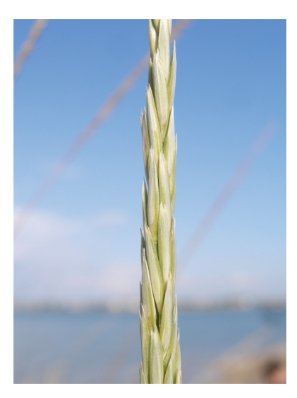
Fig. 2. Inflorescence of Ammophila arenaria (L.) Link subsp. arundinacea H. Lindb.